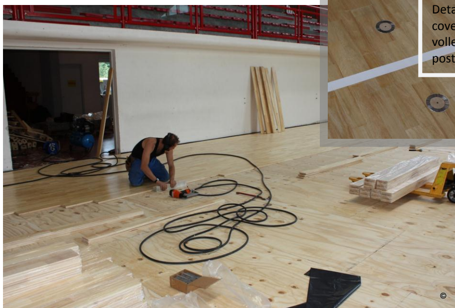
Detail covers volleyball posts